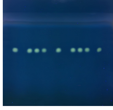
Figure 5. TLC Analysis of plate by the TLC Explorer under VIS excitation (top) and UV 366 nm excitation (bottom). The tracks 1, 5 and 9 are the references of dexamethasone acetate and 2-4 and 6-8 are the samples. The plates were derivatized with a mixture of dihydroxybenzaldehyde, glacial acetic acid and sulfuric acid.