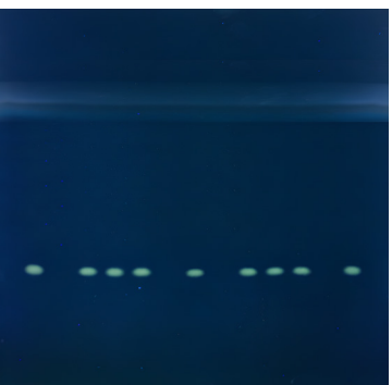
Figure 4. TLC Analysis of plate by the TLC Explorer under VIS excitation (top) and UV 366 nm excitation (bottom). The tracks 1, 5 and 9 are the references of dexamethasone and 2-4 and 6-8 are the samples. The plates were derivatized with a mixture of dihydroxybenzaldehyde, glacial acetic acid and sulfuric acid.