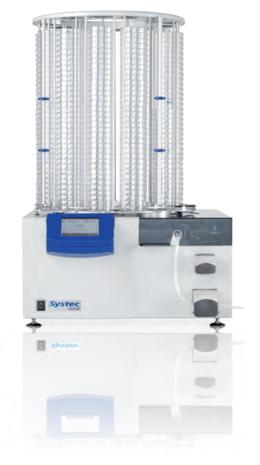
Plate pourer and tube filler Systec Mediafill